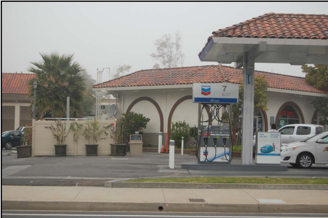
② Chevron Service Station-SWC Del Obsipo Street and Camino Capistrano with Possible Soil Remediation