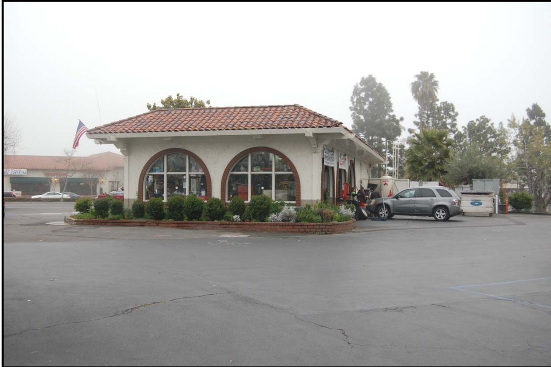
① Chevron Service Station-Southwest Corner of Del Obsipo Street and Camino Capistrano