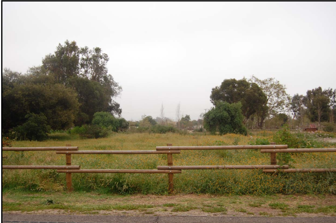
⑨ Open-space Park Site-Former Landfill Location-South of Del Obsipo Street, West of Los Rios Street, East of Paseo Adelanto