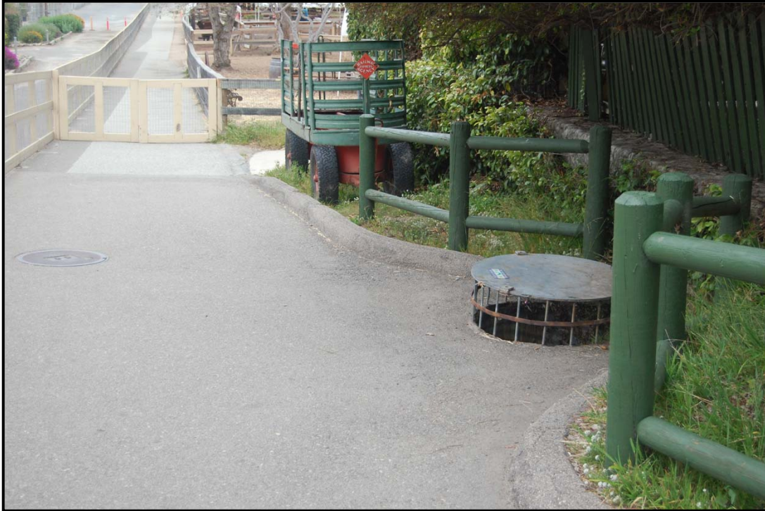
⑦ Surface Drainage System Adjacent to Nursery and Livestock /Petting Zoo (Western Margin of Project)