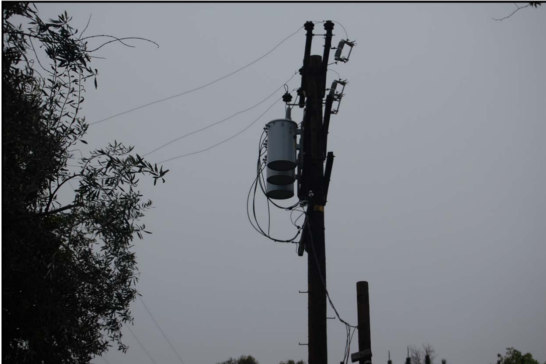
⑧ Typical Pole-Mounted Transformer