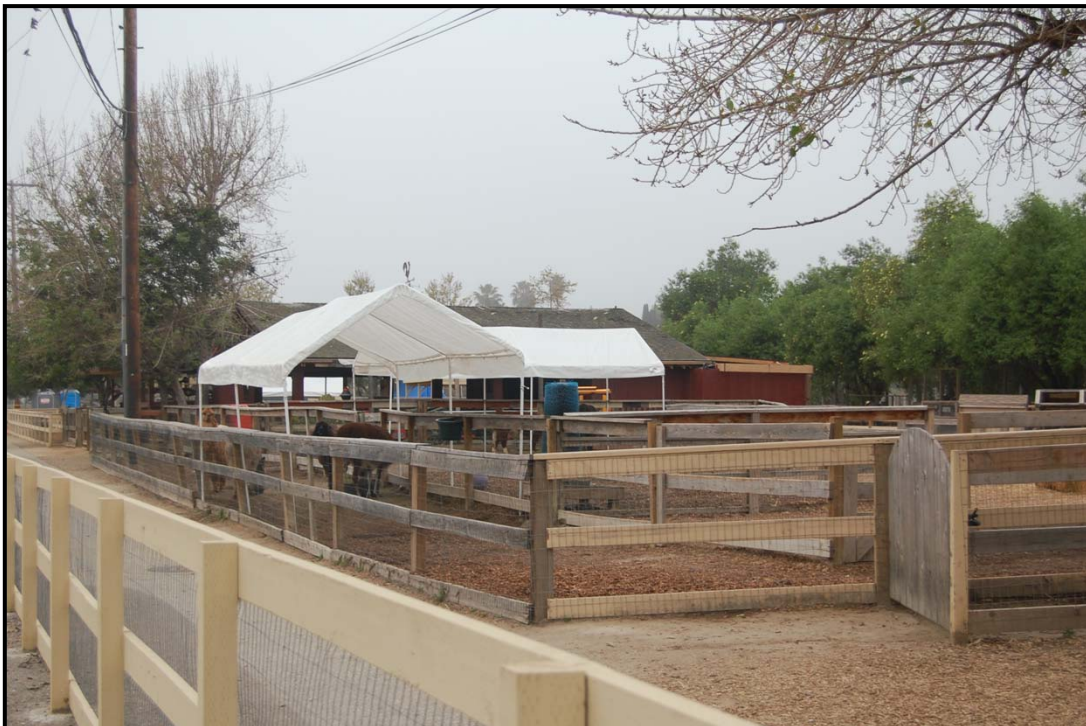
Commercial Nursery-(Western Margin of Project)