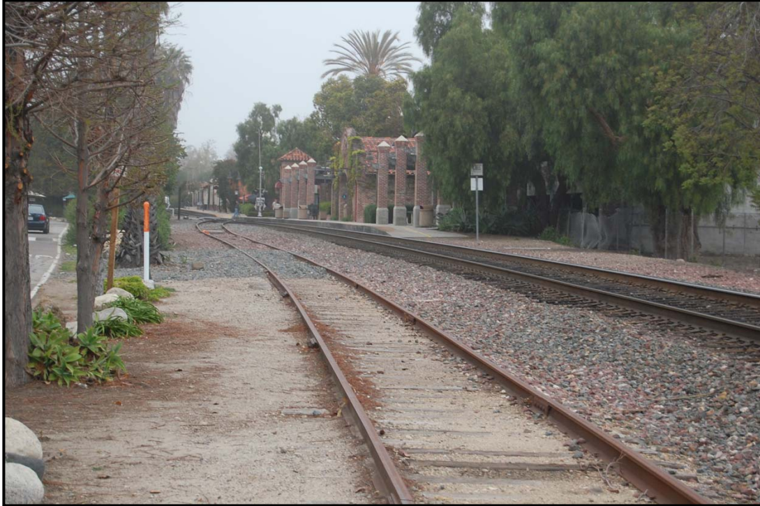
③ AMTRAK Railroad Tracks and Associated Site Use (Western Boundary of Project)