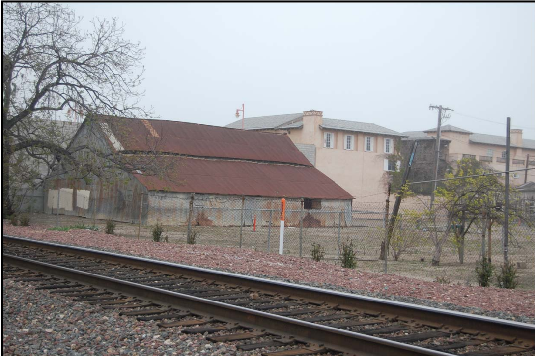
④ AMTRAK Railroad Tracks and Associated Historic Structure (Western Boundary of Project)